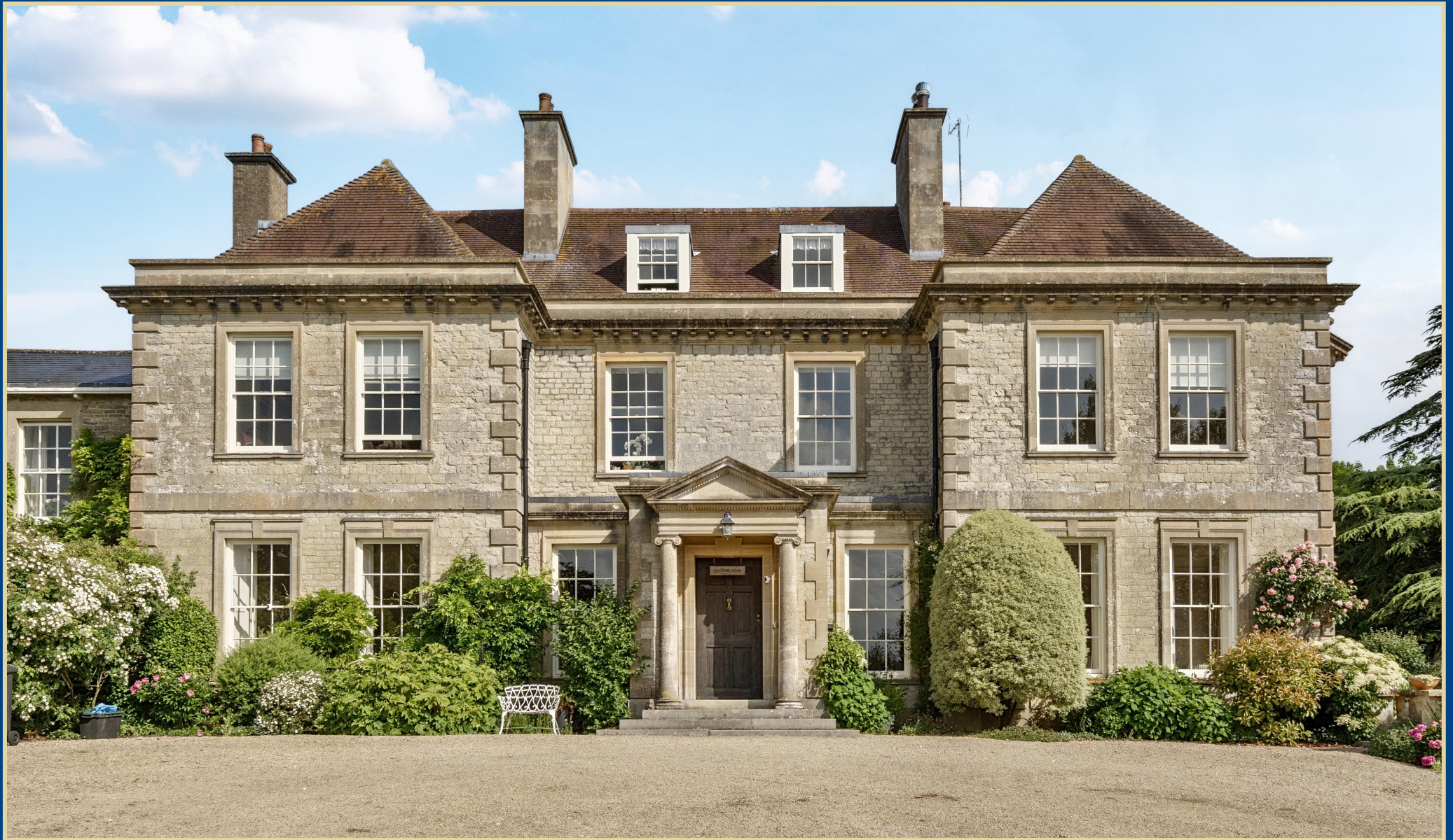
Lattiford House, Wincanton, Somerset, BA9