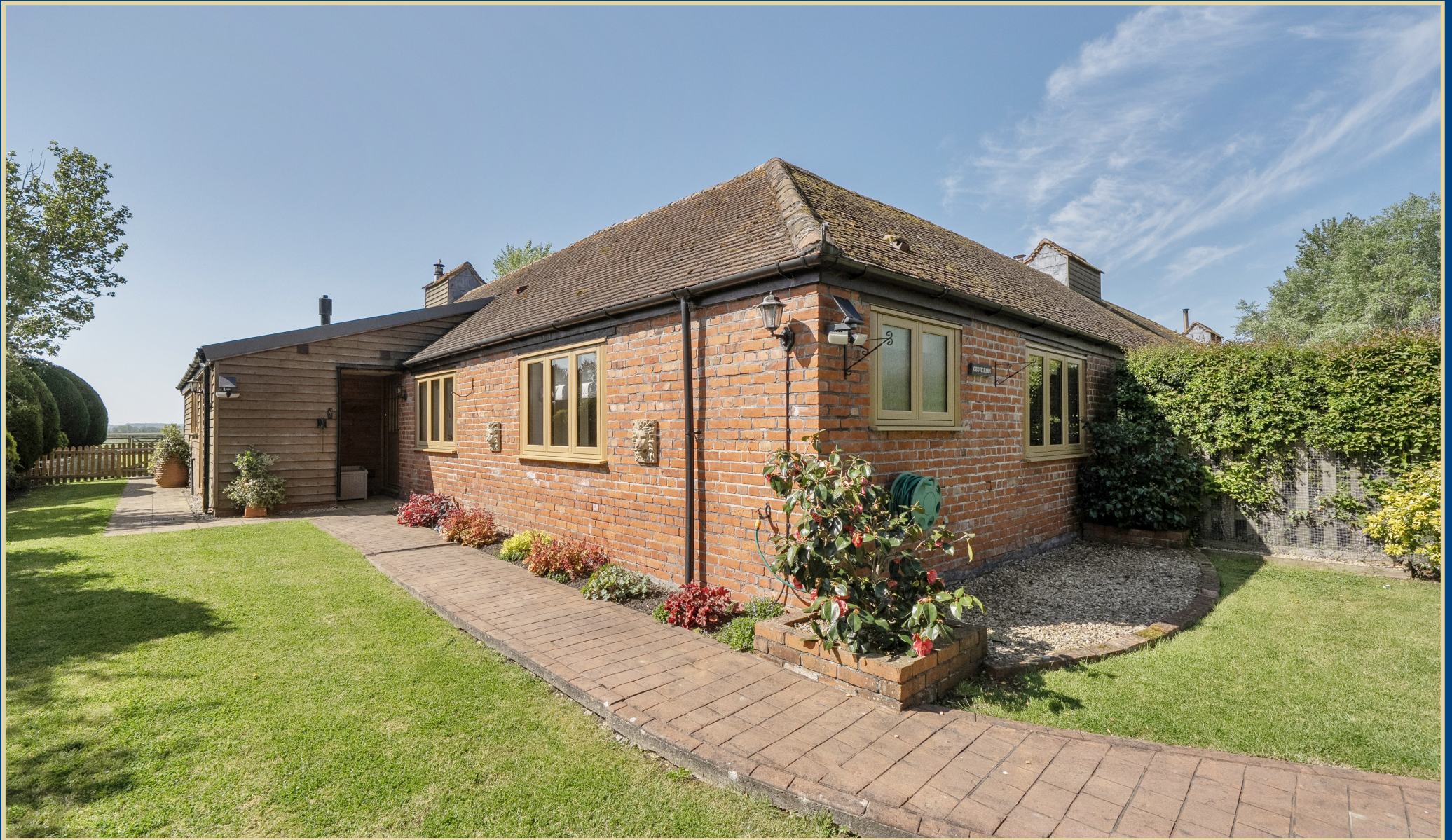
Grove Barn, Sutor Farm, Horwood, Wincanton, Somerset, BA9